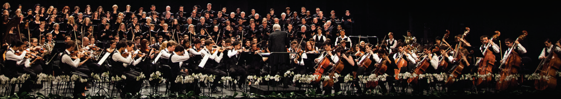
Photos of MasterVoices at the 2014 Webber Festival

For more information and tickets, visit tillescenter.org