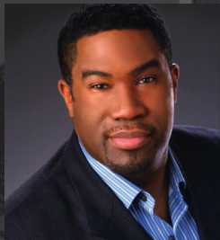
Eric Owens Mefistofele