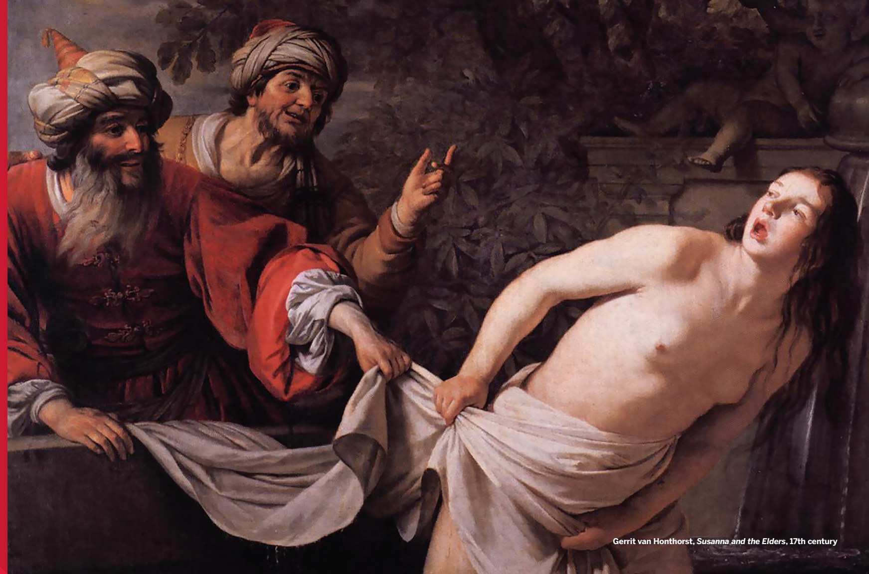
Gerrit van Honthorst, Susanna and the Elders , 17th century

— Kelli O'Hara, Knickerbocker Holiday (2011) and The Mikado (2012)