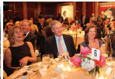
Left: Patrons and Chorale Members at the 2013 Verbier Festival. Right: Guests at 2013 Spring Benefit