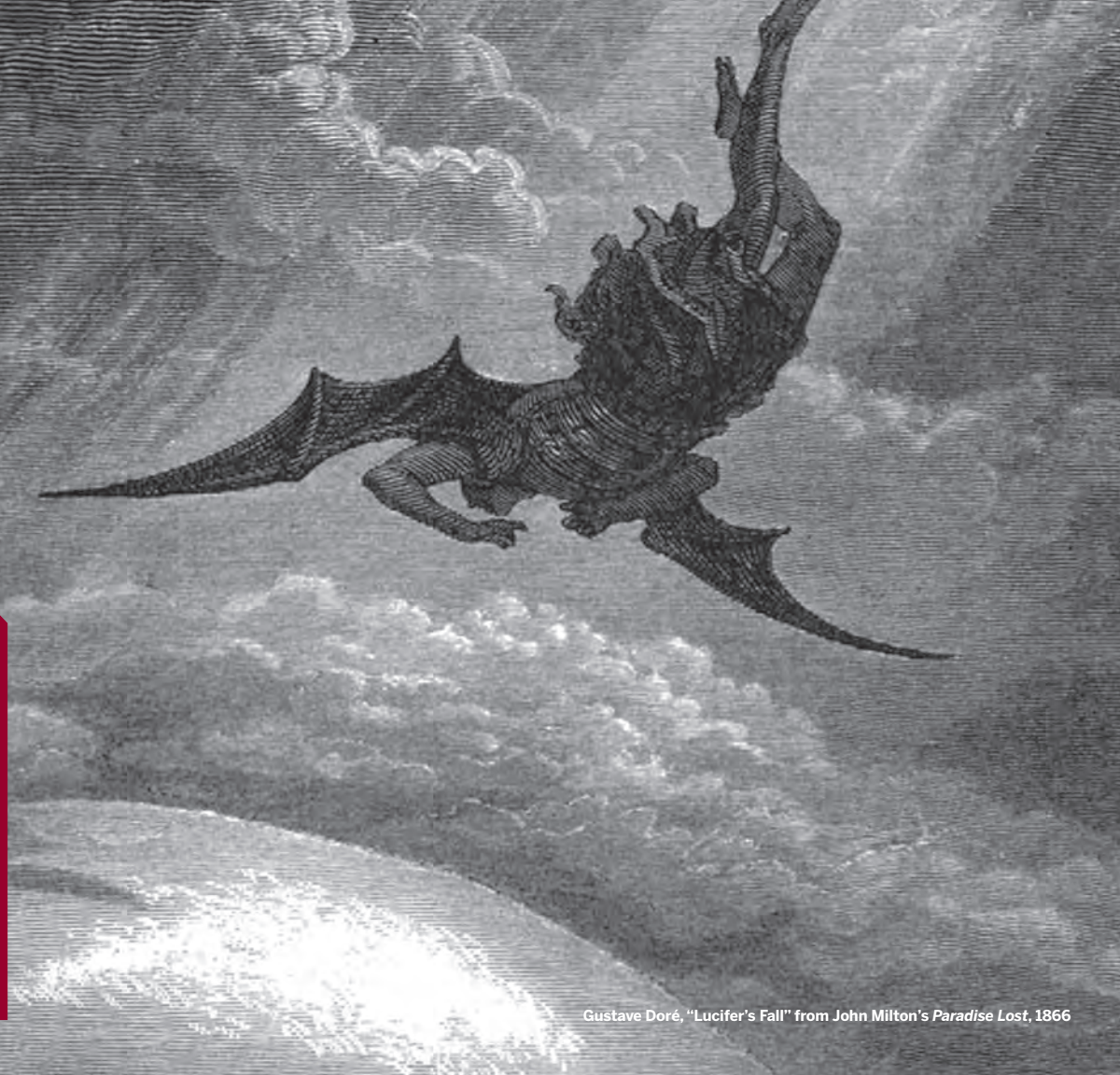
Gustave Doré, "Lucifer's Fall" from John Milton's Paradise Lost , 1866